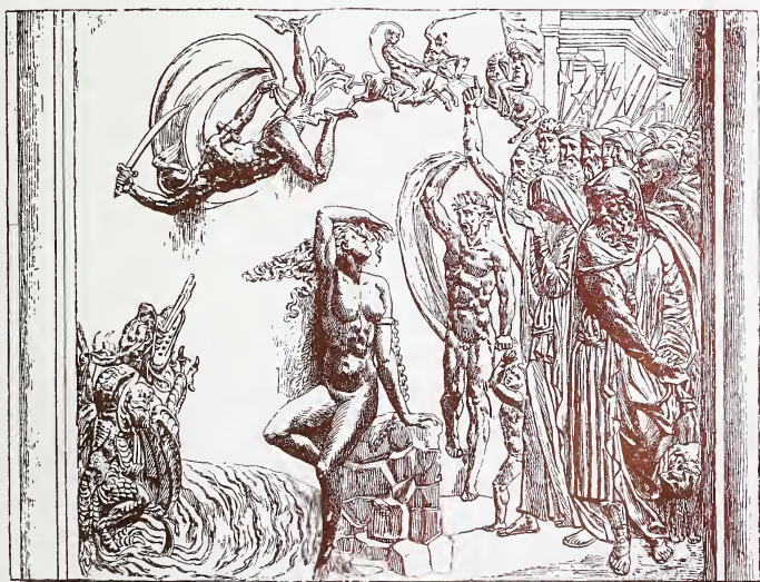
BAS-RELIEF—PERSEUS AND ANDROMEDA.